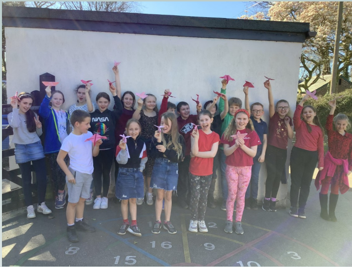
Blaise class with their Origami Birds of Freedom

To help raise money this year for Comic Relief's Red Nose Day, children were invited to come to school dressed in something red. Children completed exciting activities during the day and we are delighted to have raised £84.00 for this worthy cause.